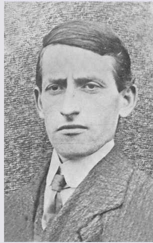
Evans in Row F, Grave 11